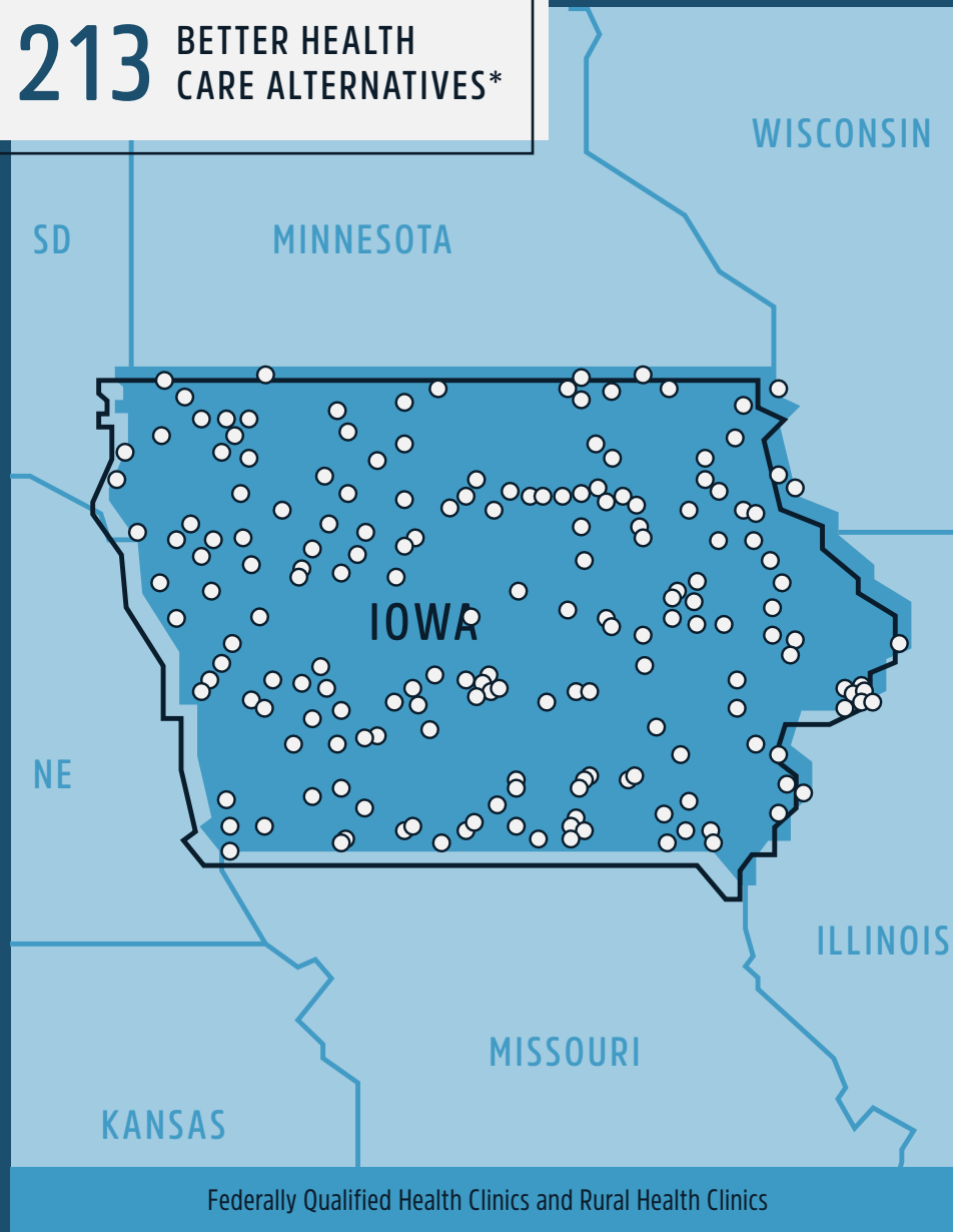
Federally Qualified Health Clinics and Rural Health Clinics